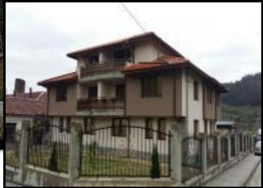
Guest house “Mesta”